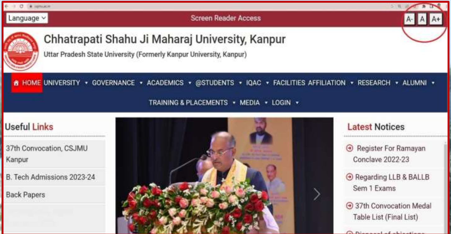
Fig. - Divyangjan Accessible Website, Screen Reading Software