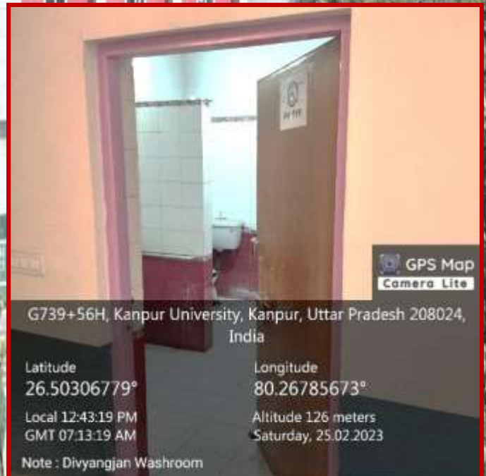
Fig. 1, 2 & 3 Divyangjan Friendly washrooms