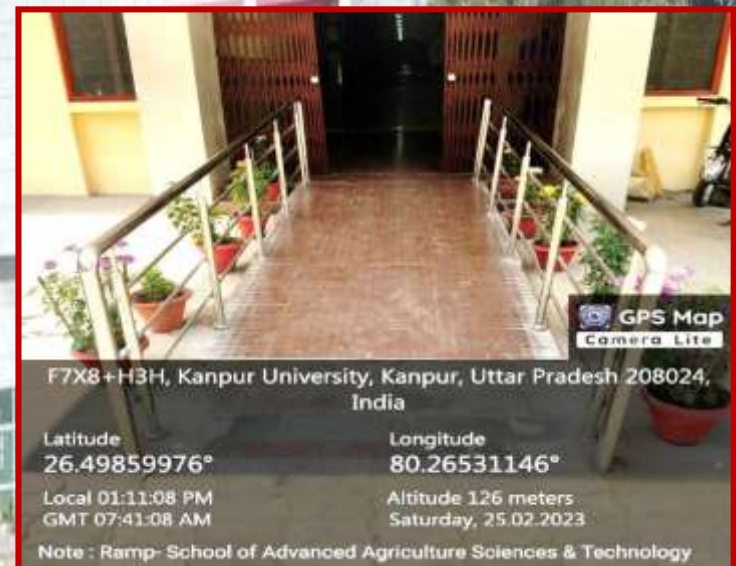
Fig. 1, 2, 3, & 4- Ramps at different departments