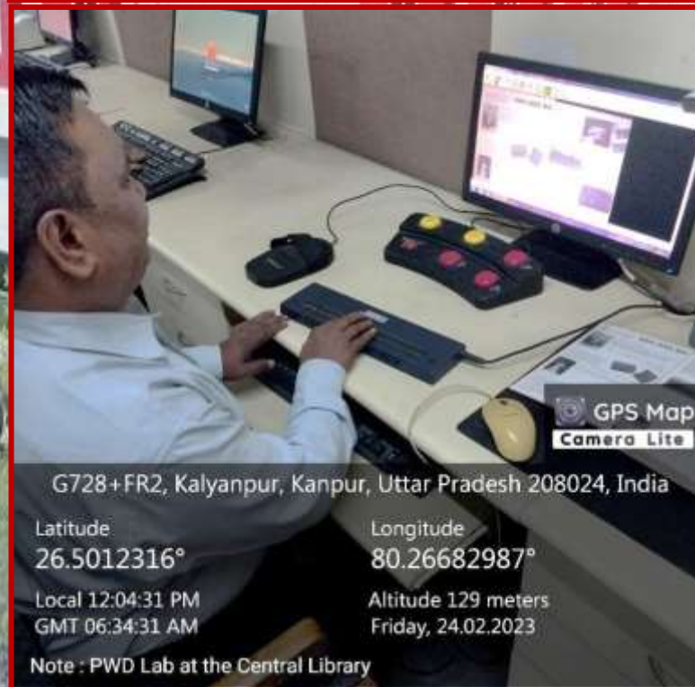
Fig. 1 & 2 Braille facilities for Divyangjan