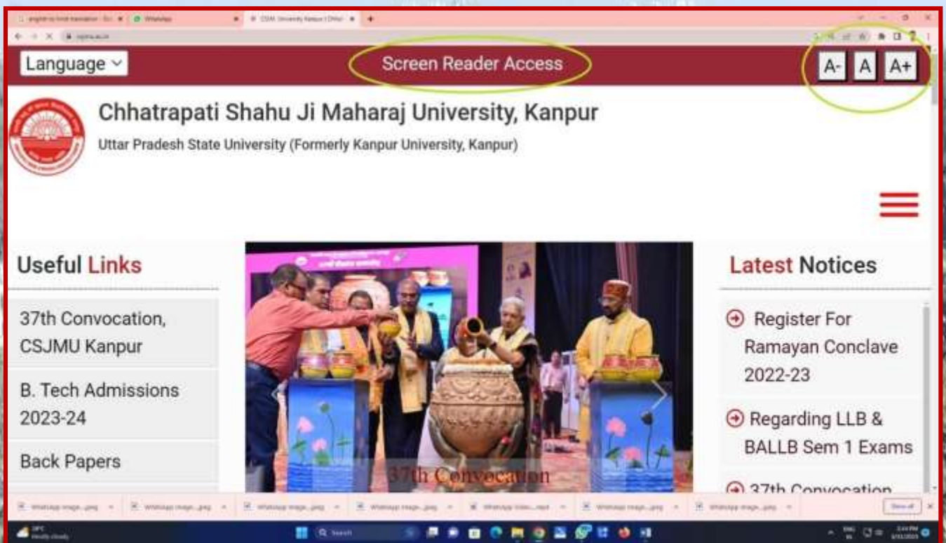
Fig. 3 Divyangjan Accessible Website, Screen Reading Software